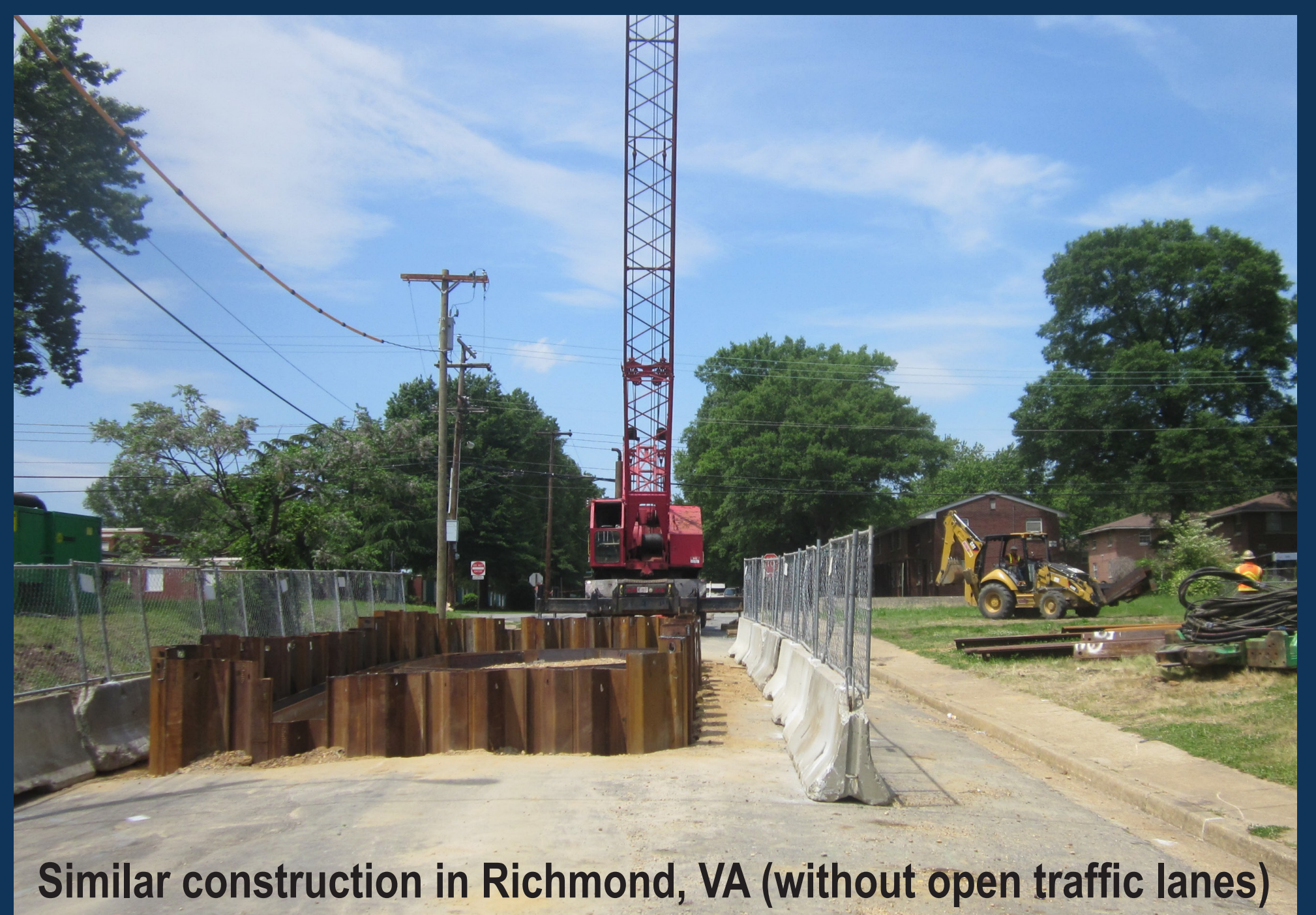
Similar construction in Richmond, VA (without open traffic lanes)